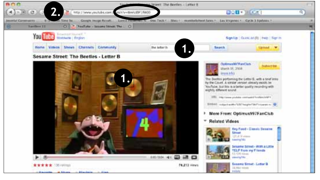
Figure 3: YouTube Web Site